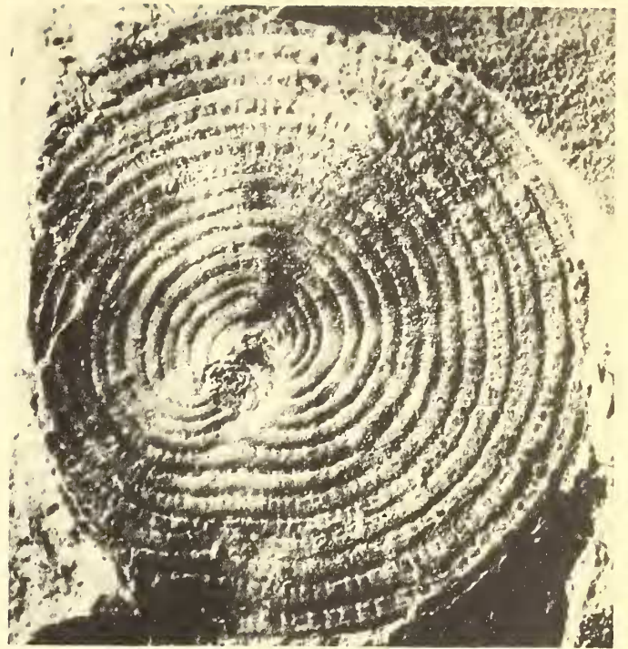
2 3 mm.